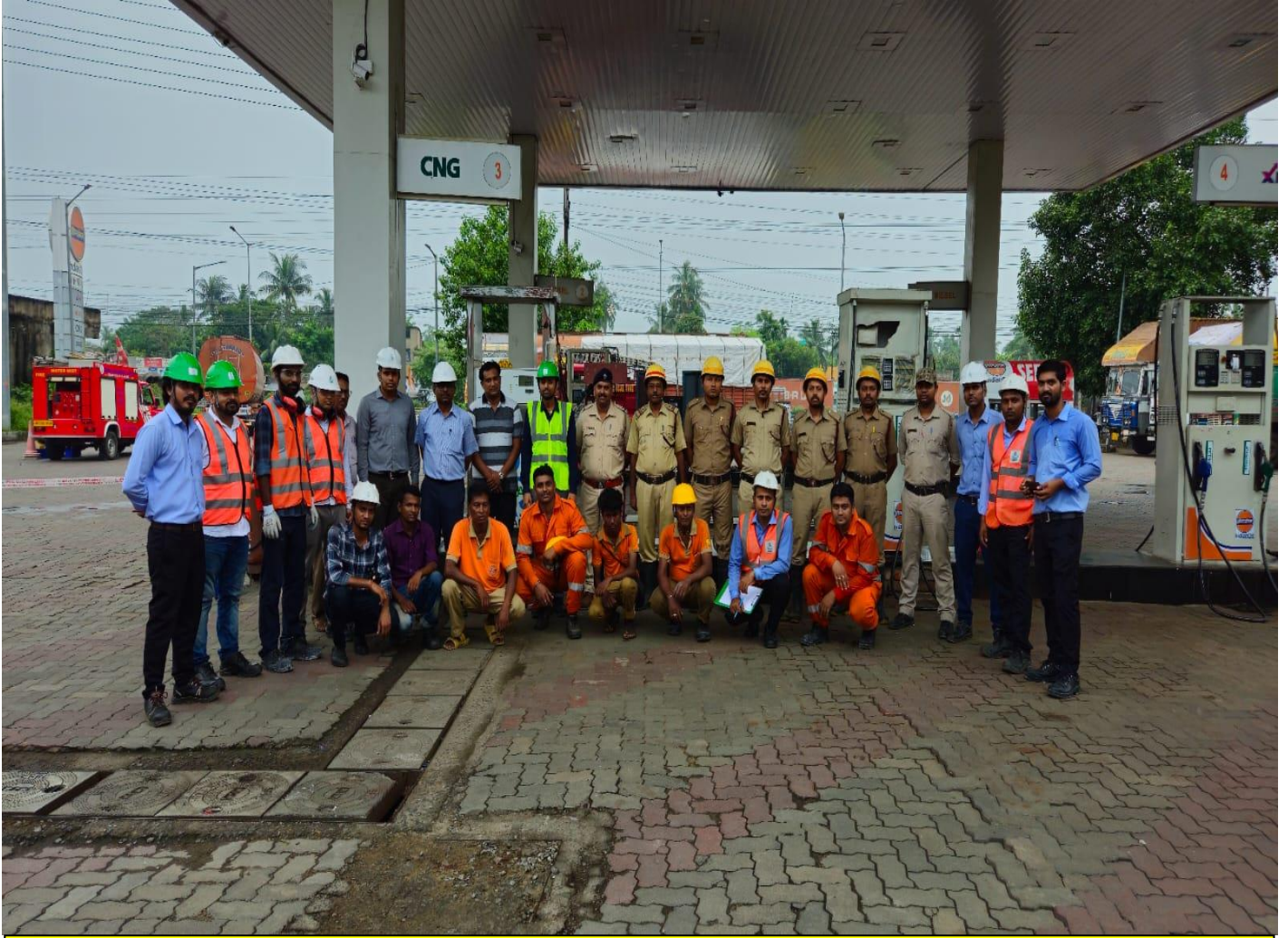
9.Group Picture with all Participants