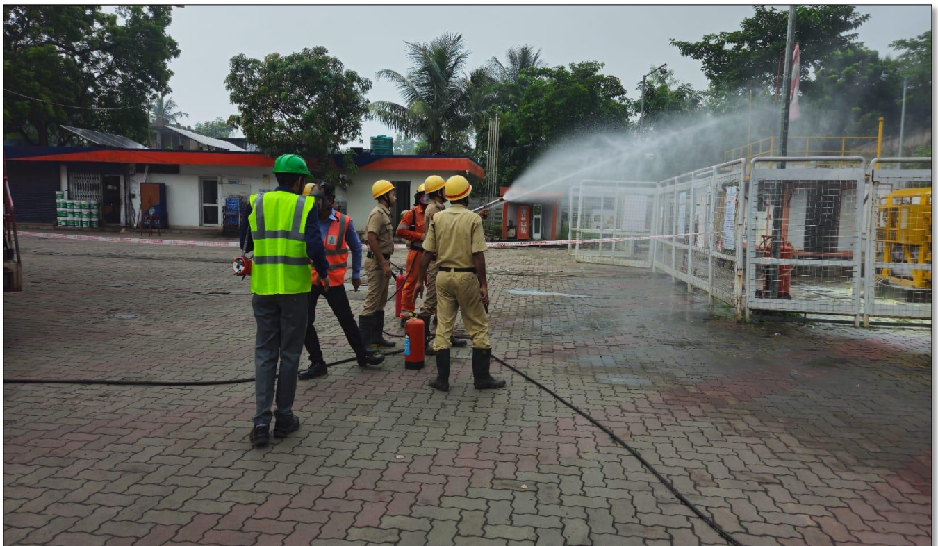
4. Fire Fighting by WBF&ES and BGCL Fire Crew