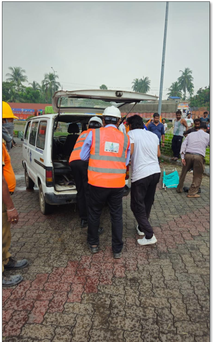
2. Casualty rescuing and shifting by BGCL HSE Team