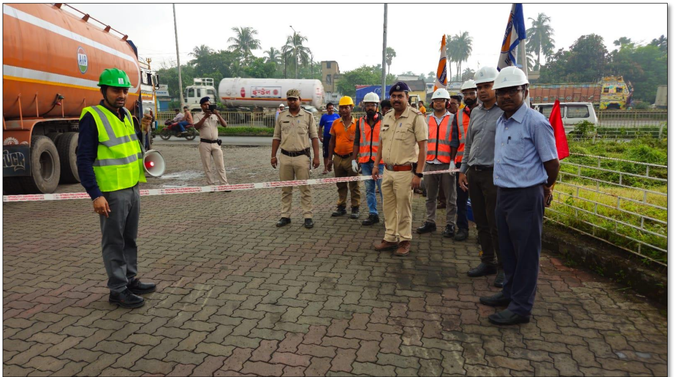
6. Traffic and Crowd Management by Panchala Police Station team