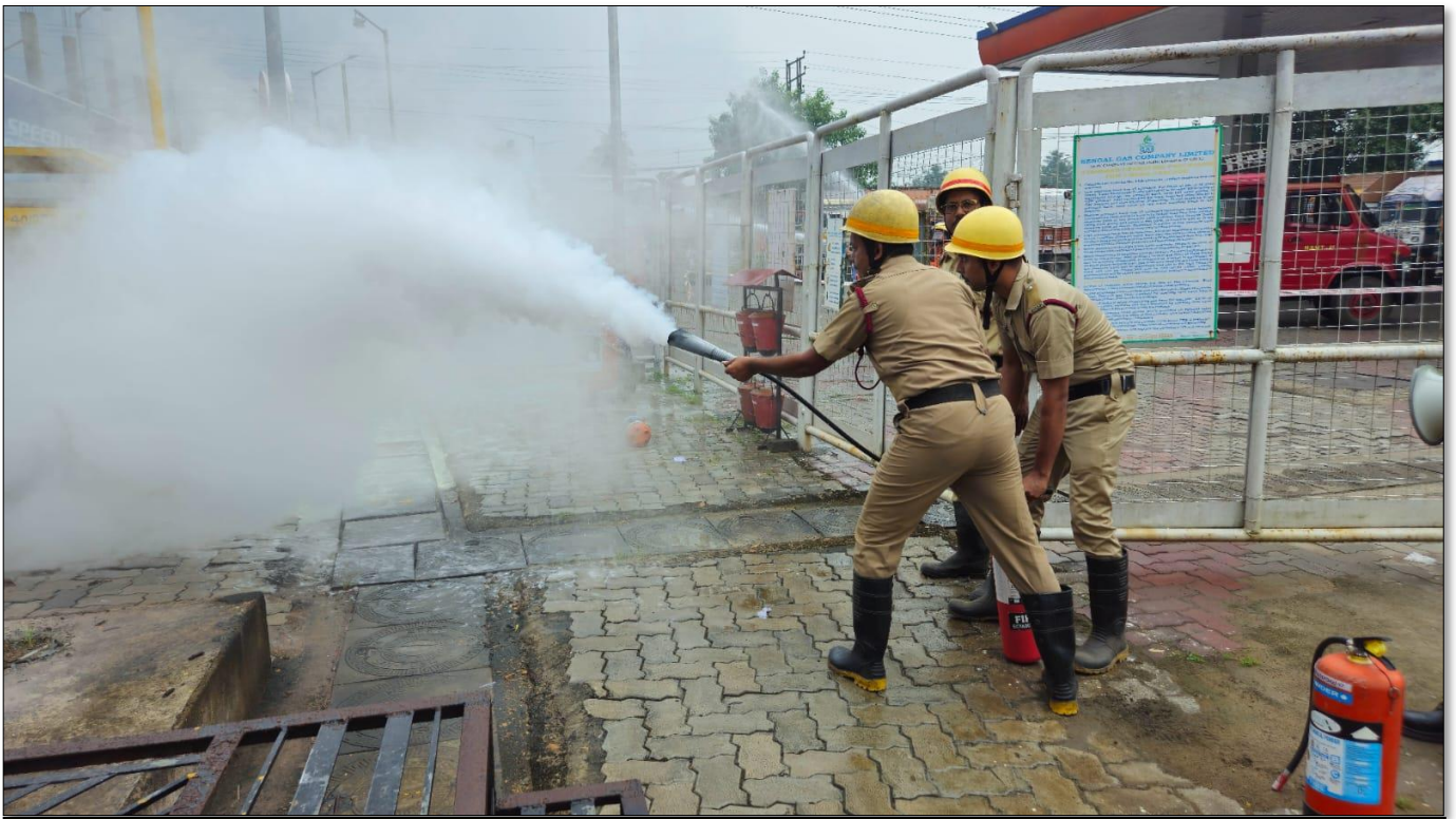
3. Charging Fire Extinguisher by WBF&ES Fire Crew to extinguish Fire