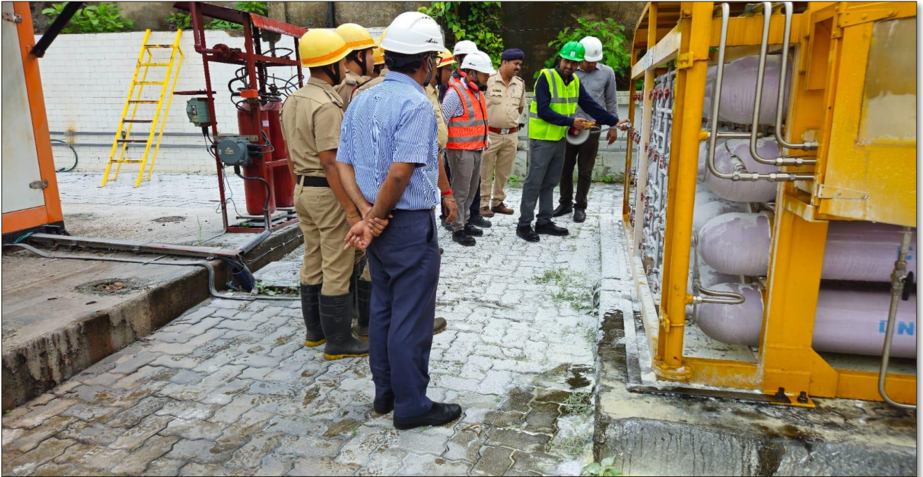
7. Gas Leakage Checking by Safety Officer in presence of SIC, Head (CA & CO and HSE), and District authorities