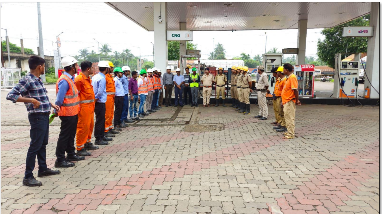
8. Briefing by Safety Officer, Head (CA & CO and HSE), Head (O&M) and district authorities