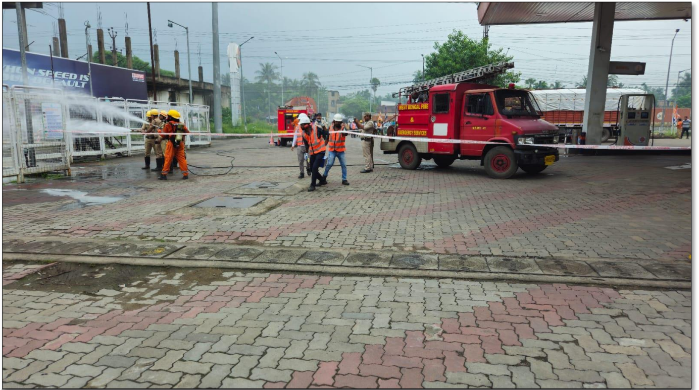
5. Fire Fighting by WBF&ES and BGCL Fire Crew